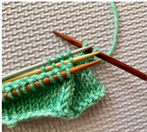
S Fabric Folded

Step 2: Fold the pleat by flipping the needle with the turnback stitches counterclockwise.