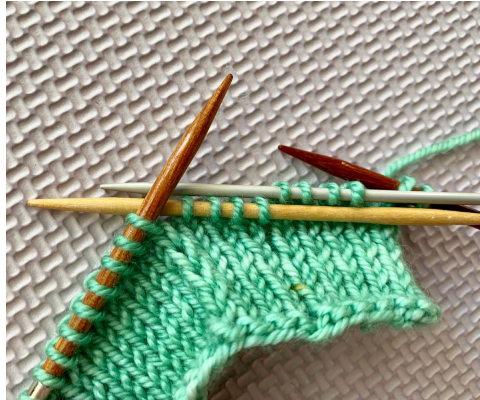
S Fold Preparation

Step 1: Transfer the underside stitches to one double-pointed needle, transfer the turnback stitches to another double-pointed needle, and leave the face stitches on the left-hand working needle.