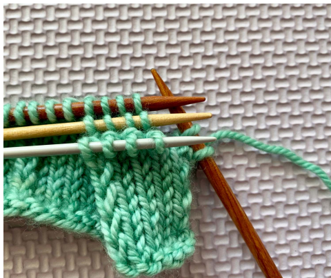
Z Fabric Folded

Step 2: Fold the pleat by flipping the needle with the turnback stitches clockwise.