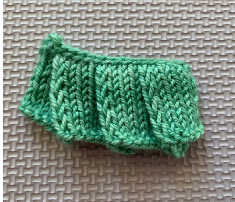
Z or Left-fold Pleats

In left-fold or "Z" pleats the edge of the visible fold points to the left.