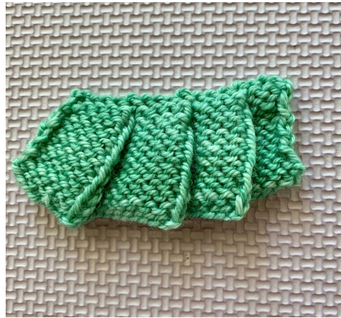
WS of Knife Pleats

A column of purl stitches at the interior fold will make that fold draw back behind the stockinette, forming a distinct ridge. Be sure to pull the first purl after the knit ridge snugly so the knit ridge will be even. With the exception of the soft pleats photo above, all of the photos in this article show crisp pleats. The photo below shows the purl ridge on the wrong side of knife pleats.