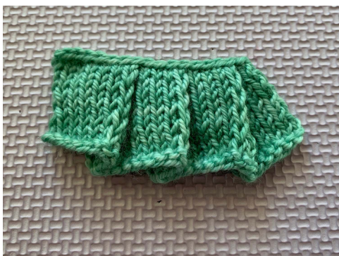
S or Right-fold Pleats

In BF right-fold or "S" pleats the edge of the visible fold points to the right.