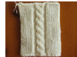
Level 1 swatch example

A 2-4 page report on Blocking and Care of Hand Knits, nineteen knitted swatches, eight gauge calculations, twenty-two questions to research and answer, and one mitten.