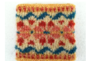
Fair Isle wristlet project.