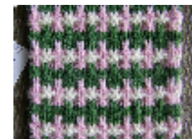
Level 3 swatch example

Two book reviews and two magazine reviews, a report on six fibers used in knitting, a report on two knitting traditions, nineteen knitted swatches, twenty questions to research and answer, self-designed sweater and hat, one Aran and the other Fair Isle or Scandinavian.