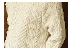
Aran Sweater Project